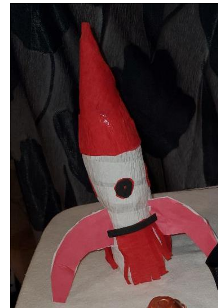
I can upcycle a toy