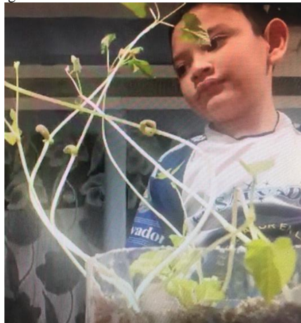
I can Upcycle my kitchen vegetable scraps to regrow them!