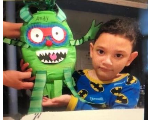
I can create an environmentally friendly "GREEN" monster