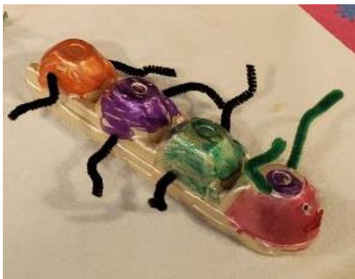
I can Upcycle to make Art