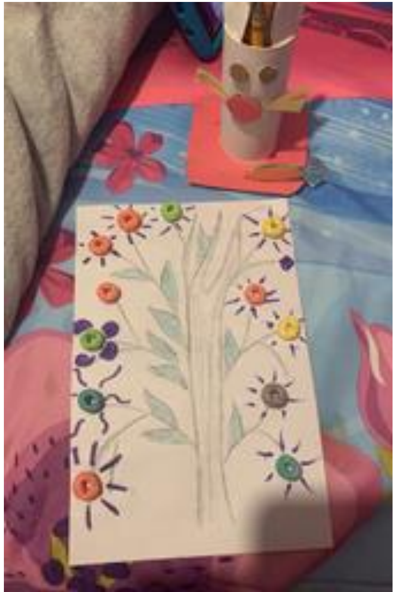
Ashley Morales Grade 3H "I upcycled something useful and something beautiful."